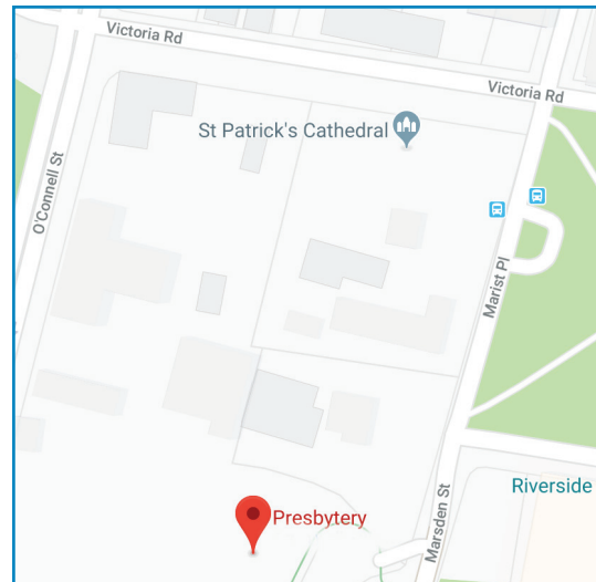
St Patricks Cathedral Hall 1 Marist Pl, Parramatta NSW 2150