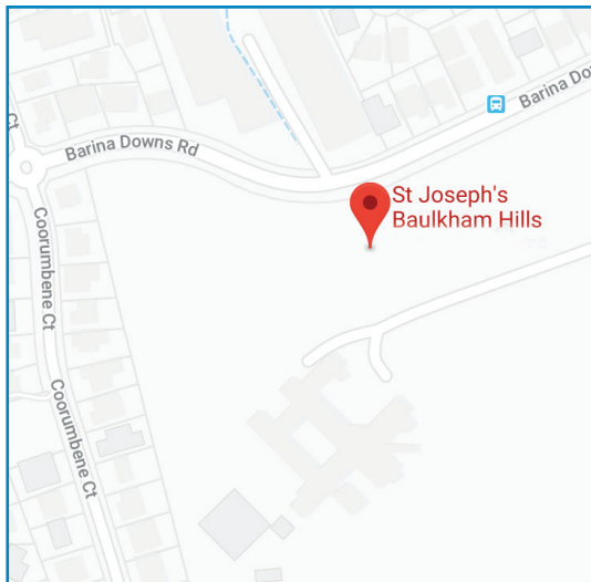
St Josephs Centre 33 Barina Downs Rd, Baulkham Hills NSW 2153