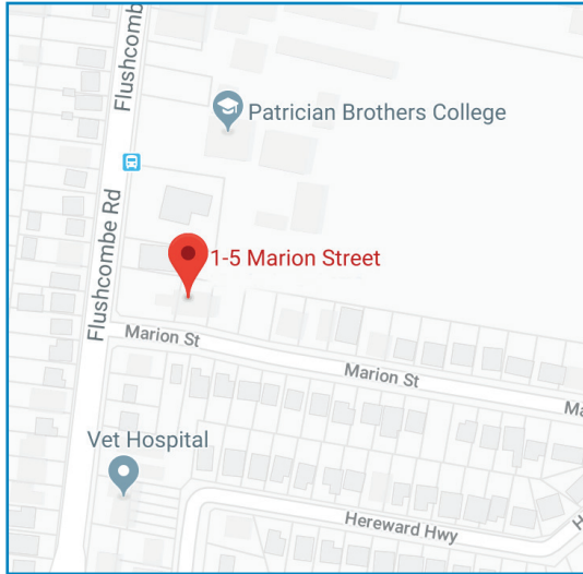
Institute for Mission 1-5 Marion St, Blacktown NSW 2148 (off Flushcombe Road )